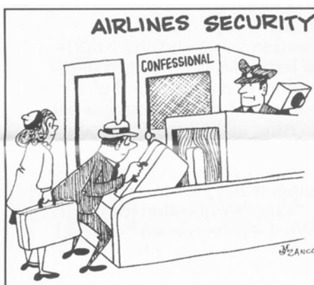
from The Joyful Noiseletter

from Hymn 657, words by Charles Wesley (1707-1788)