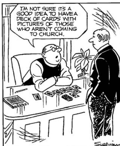
from The Joyful Noiseletter ©Ed Sullivan Reprinted with permission