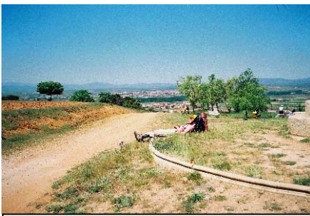
Taking a break along the road