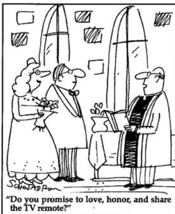
from The Joyful Noiseletter Reprinted with permission